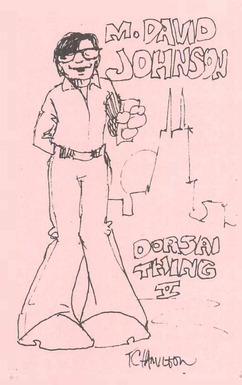
by: Todd Hamilton (Nametag)

and mate lifting) and the Saturday 10 am Weapons Panel which concentrated on the most effective use of Chinese Yo-Yo's and small tupperware cups.